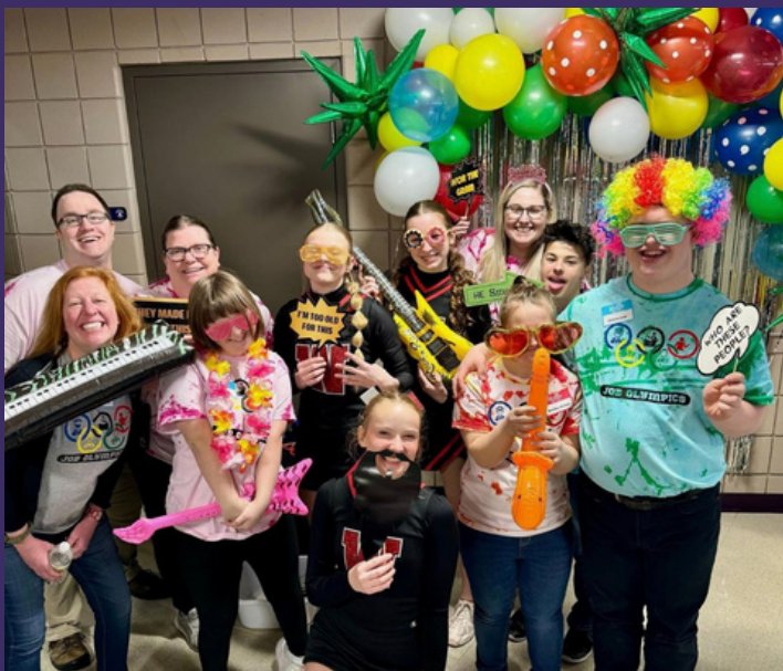
This is the Job Olympic participants, cheerleaders, and staff having fun at Job Olympics 2024.